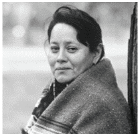
Mary Brave Bird